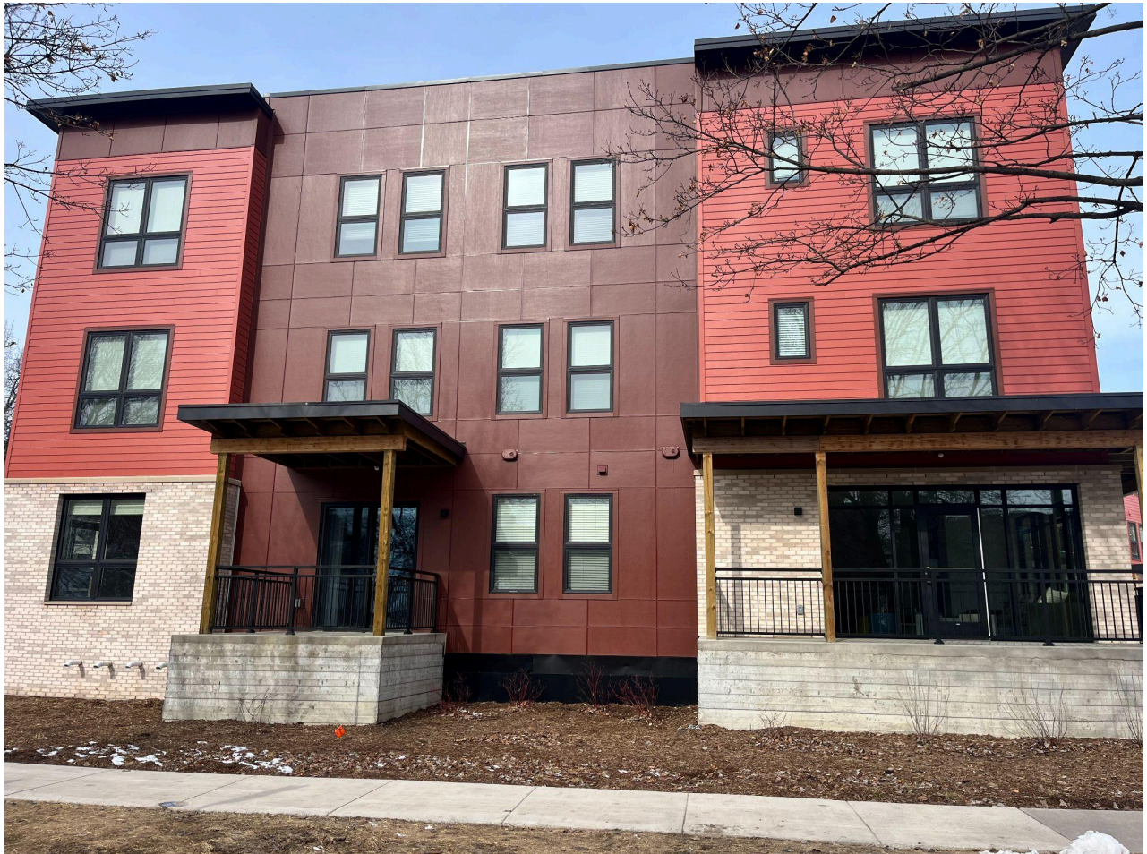
View of the Mural Location from the 780 block of West Washington.