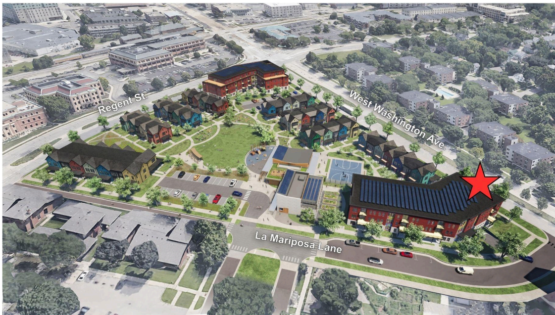
Mural location in relation to the rest of Bayview's campus.