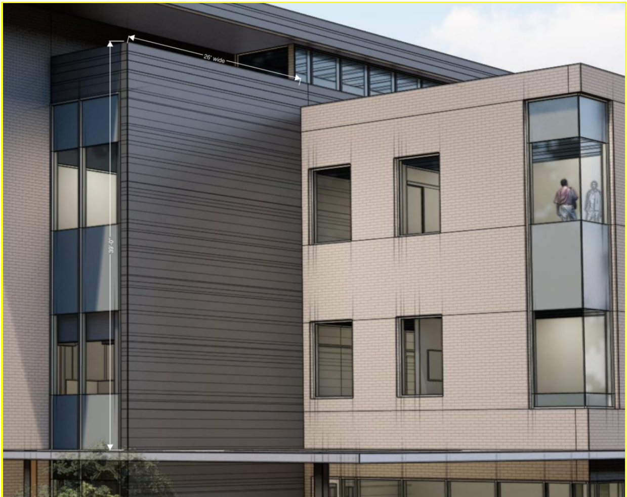
Potential Exterior Wall Art Location (Metal Panel wall/ Metal Stud Framed Wall) 39' high x 26' wide