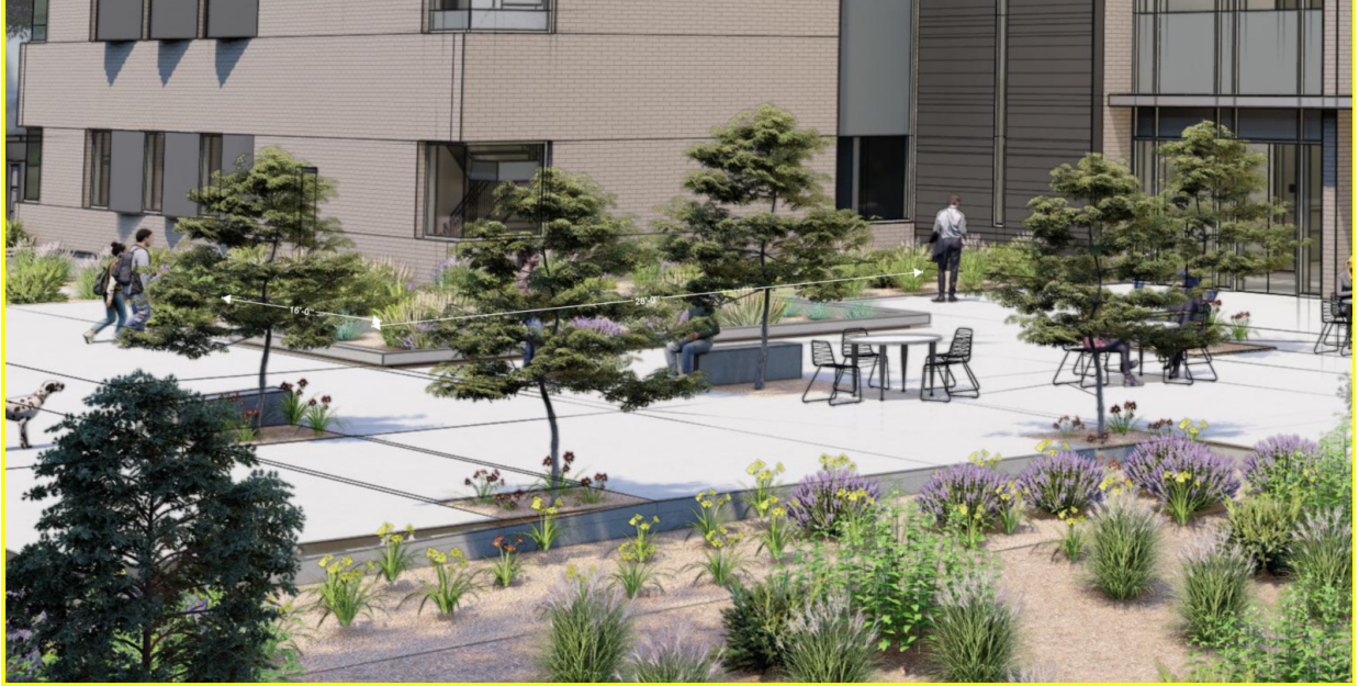
Potential Plaza Art Location