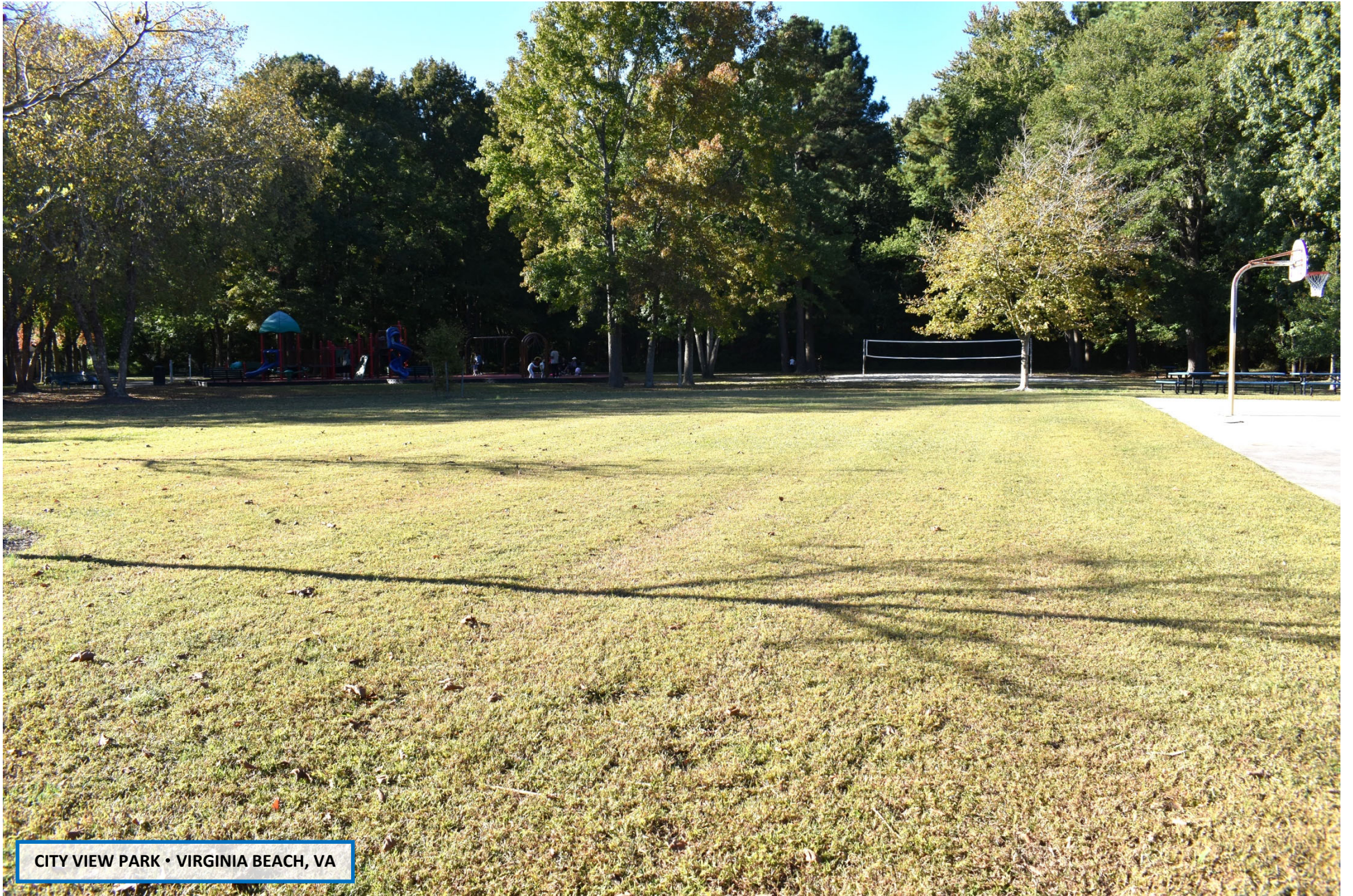
CITY VIEW PARK • VIRGINIA BEACH, VA