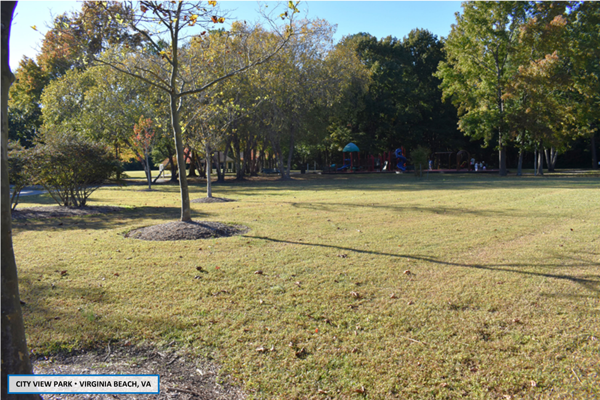
CITY VIEW PARK • VIRGINIA BEACH, VA