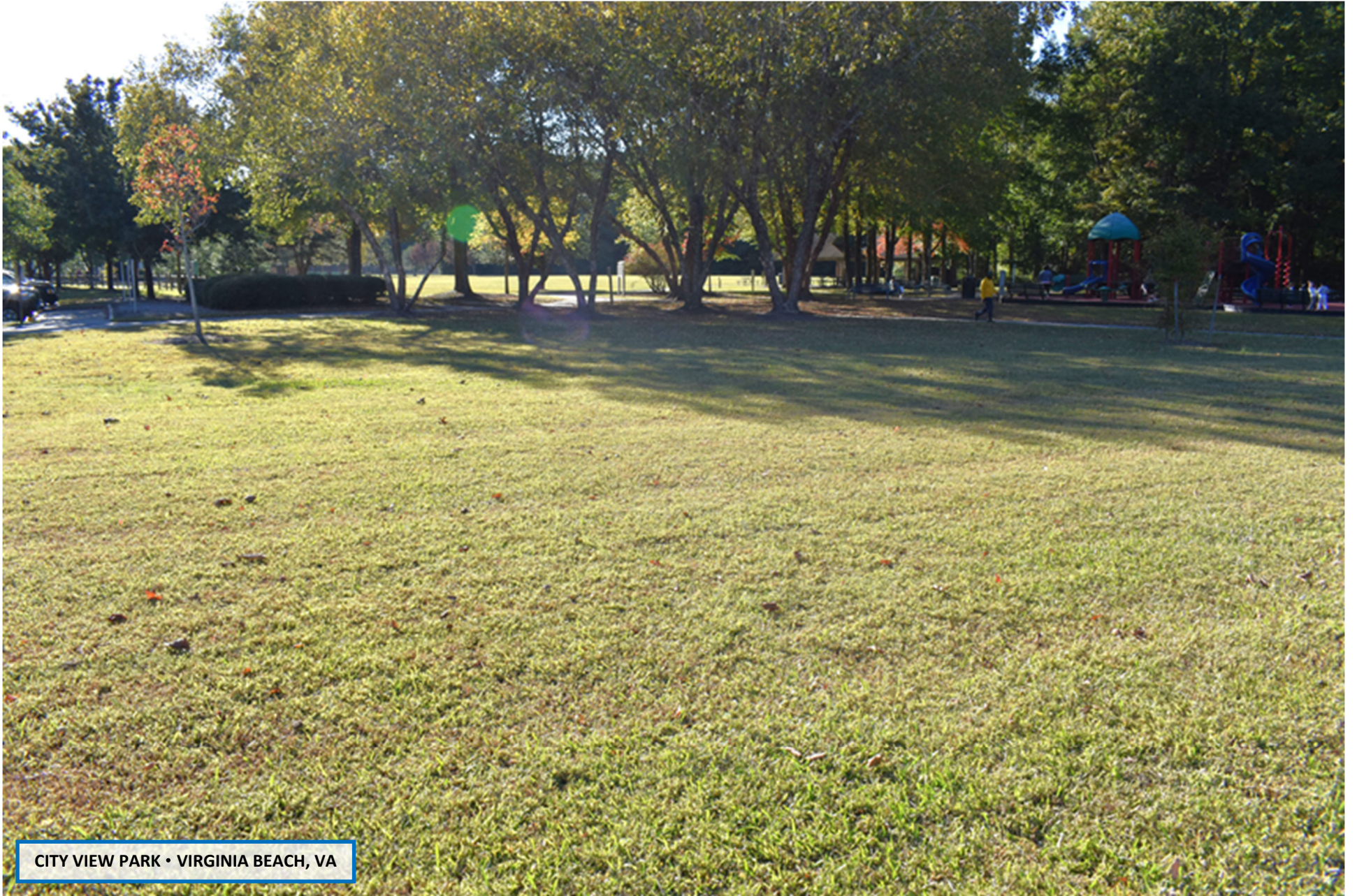
CITY VIEW PARK • VIRGINIA BEACH, VA